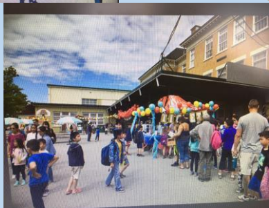
Grade 4 Students at Timberline Ranch