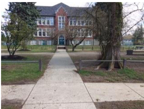
Marguerite entrance, spring 2017

April was another busy month at Shaughnessy. We hosted three and four year olds and their parents/caregivers for our annual Ready Set Learn program. This Ministry program provides an opportunity for younger children and their parents to participate in play-based learning readiness activities and also meet a number of our community partners.