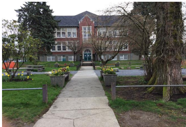
Shaughnessy's Outdoor Classroom, spring 2018

This transformation is now complete and we are starting to use this wonderful space. Please watch for an invitation to our Official Opening Celebration on Wednesday, May 9 th . We couldn't have done this project without your support. Thank you.