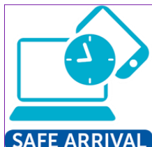
Safe Arrival (page 2)