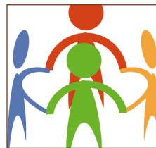
PAC News (page 5)