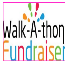
Library News (page 3)