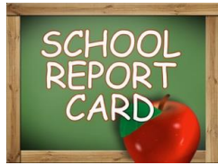
New Reporting (p.2)