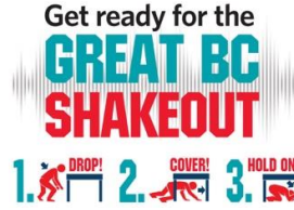
Great BC Shakeout (p.2)