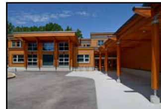
Volume 2 October 2017

Lord Kitchener Elementary School 3455 West King Edward Avenue Vancouver, BC V6S 0C7 Tel: 604-713-5454 Fax: 604-713-5457 http://go.vsb.bc.ca/schools/kitchener