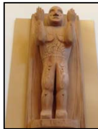
A Musqueam Welcome