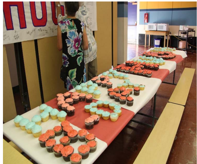
"Happy B-Day Hugh" spelled out in Cupcakes made by Grade 9s and 10s for Hugh Marshall 90th Celebration