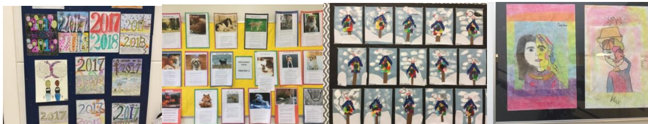
Student work by Div. 1, 2 & 8