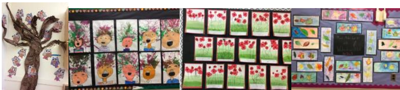
Artwork created by students in divisions 3, 7, 8 & 9